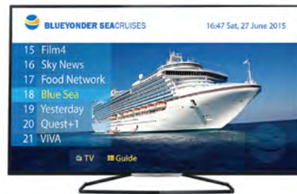
Customize the TV interface with ArtioPortal Middleware