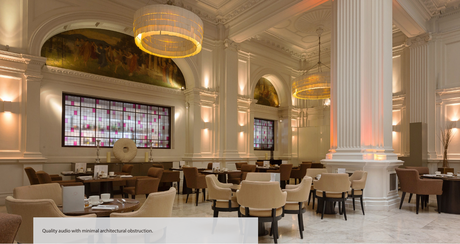
Quality audio with minimal architectural obstruction.

AT&C's audio solution of choice for this installation was the Italian audio manufacturer, K Array.