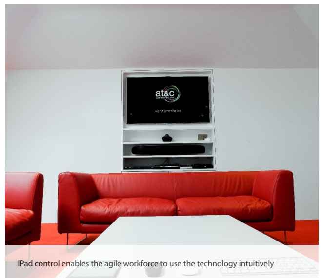
iPad control enables the agile workforce to use the technology intuitively

Bose DS40SE surface mount speakers are positioned throughout the atrium, ground and first floor offices. They are a versatile, high performance full range speakers designed for foreground and background music. Installed is a Sonos connect that allows Venture Three to play all the music they want throughout the building controlled from iPad's in 3 main areas.