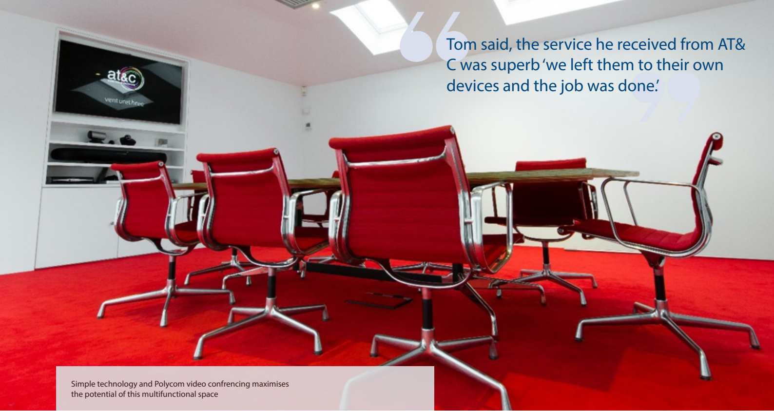
Simple technology and Polycom video conferencing maximises the potential of this multifunctional space