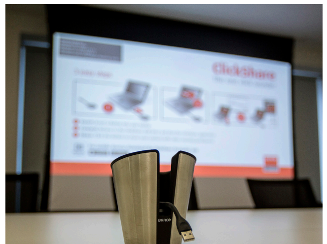
Wireless Presentation for simple and easy to use presentation.

Barco is able to seamlessly share content from a laptop or mobile device on to a presentation screen. The cable free system does not compromise the laptops settings, displaying content at the most optimal resolution. There is no waiting time to join a meeting or downloading of dedicated software. The ease of connecting the USB dongle to your device and pressing the button to share content is great for one to meetings and presentations. The final addition to the 6th Floor package was an audio Ubicast system which captures meetings and allows team sharing of information. This is extremely beneficial between UK and overseas offices as it will stream presentations to the web and Deckers Brands staff. Fully integrated into the Crestron Touch Panel, streaming and recording can begin at the touch of a button. Access to the system is simple and straightforward for team members to re stream the material post presentation. The addition of HD cameras and a dual input card for the Ubicast Streamer means that any future presentation material can be produced and distributed from one central location.